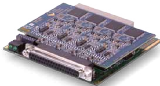
The DNx-AI-211 includes the accessory board providing the 10-32 UNF connectors and the status LEDs